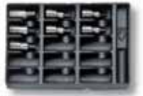
MOD. 57 T6