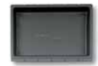
MOD. 81 T6