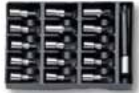
MOD. 55 T6