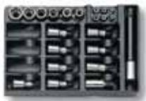
MOD. 53 T6