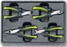
MOD. 46 T6