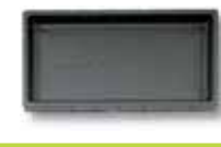
MOD. 82 T6