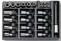
MOD. 54 T6