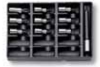
MOD. 56 T6